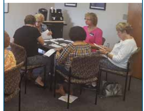
Mah Jongg lessons are off to a great start! Thank you to our teachers and their assistants.