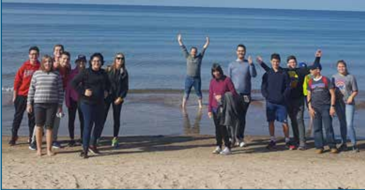
Hiking at the Indiana Dunes on Sunday, October 14.