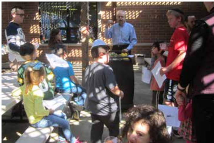
▲ After our meaningful Rosh Hashanah and Yom Kippur services, we enjoyed the festival of Sukkot and a wonderful lunch in our sukkah. The children and adults said the blessing that is recited while taking the lulav and etrog.