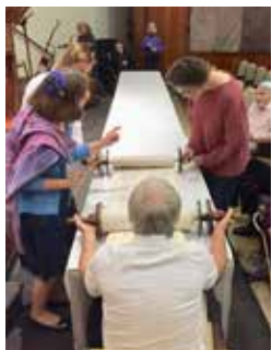
▼ Celebrating Simchat Torah