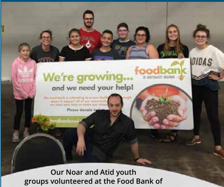
Our Noar and Atid youth groups volunteered at the Food Bank of Northwest Indiana on Sunday, September 16.