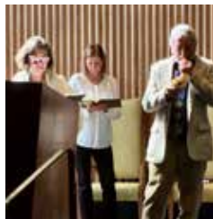
◀ ▼ High Holidays