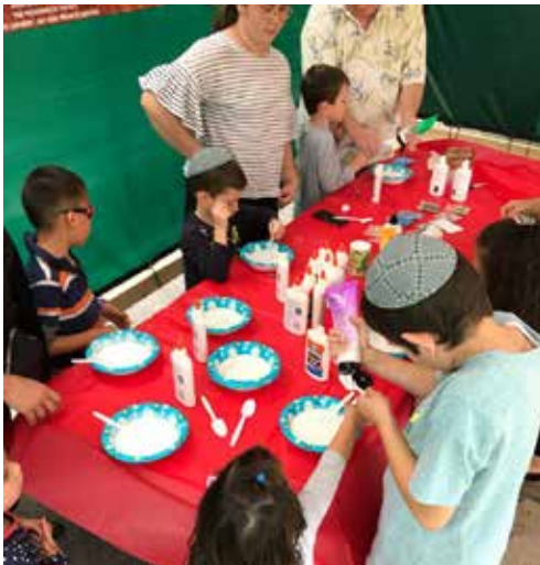
▲ Fun for all ages: making slime (and then enjoying pizza) in the Chabad sukkah.

As you can imagine, this can sometimes be a downer. It's like a crash landing after a month of inspiration and excitement. It can be depressing.