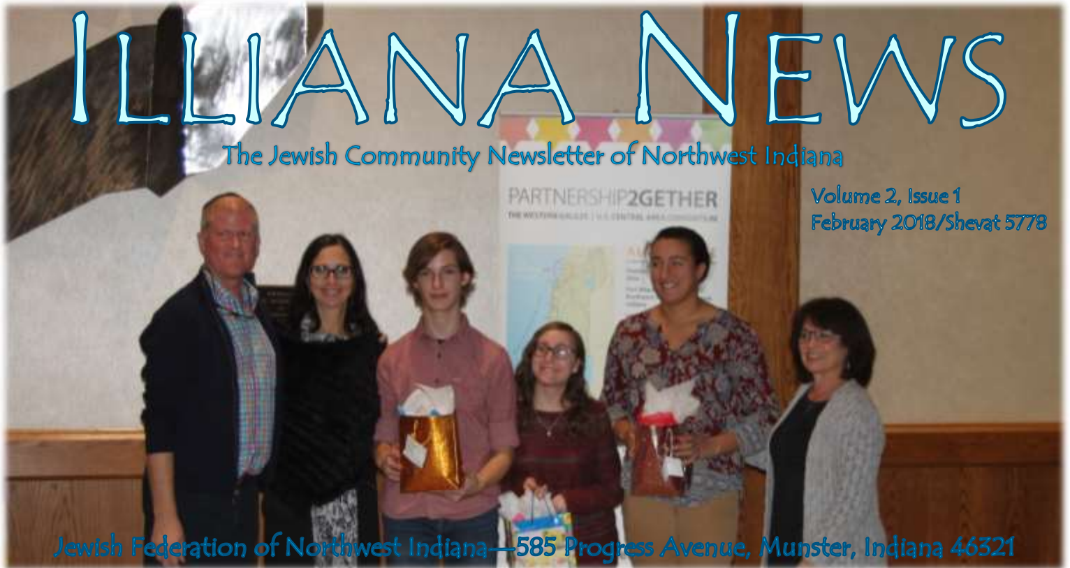
Jewish Federation of Northwest Indiana—585 Progress Avenue, Munster, Indiana 46321