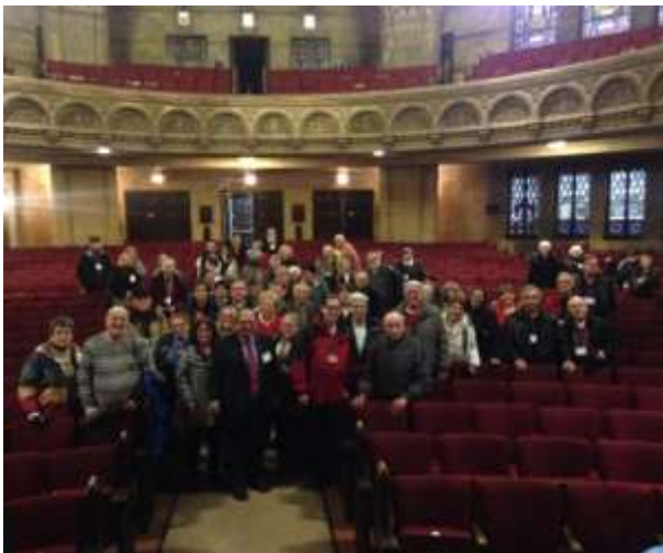
KAM Isaiah Israel Congregation in Hyde Park