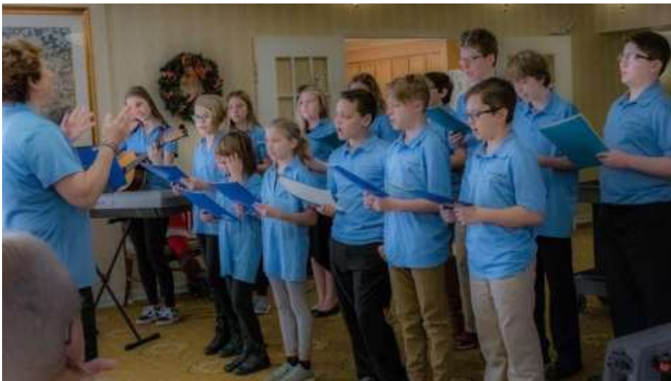
The Jr Choir of Temple Beth El entertained the residents of Hartsfield Village with Hanukkah songs. The kids put in several hours of practice time to get ready for this visit and the Hanukkah Supper at Temple Beth El.